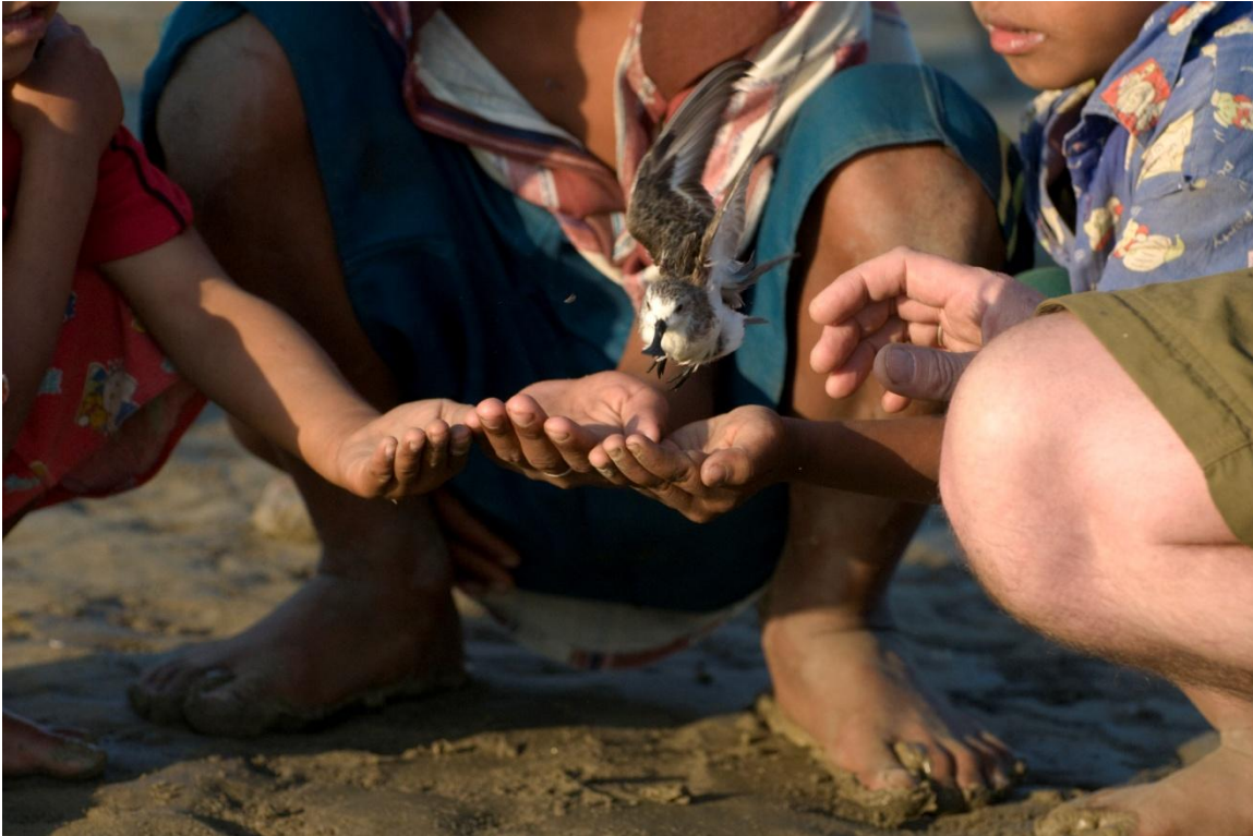
Figure 2 Spoon-billed Sandpiper released by local youth after captured by bird trappers the night before