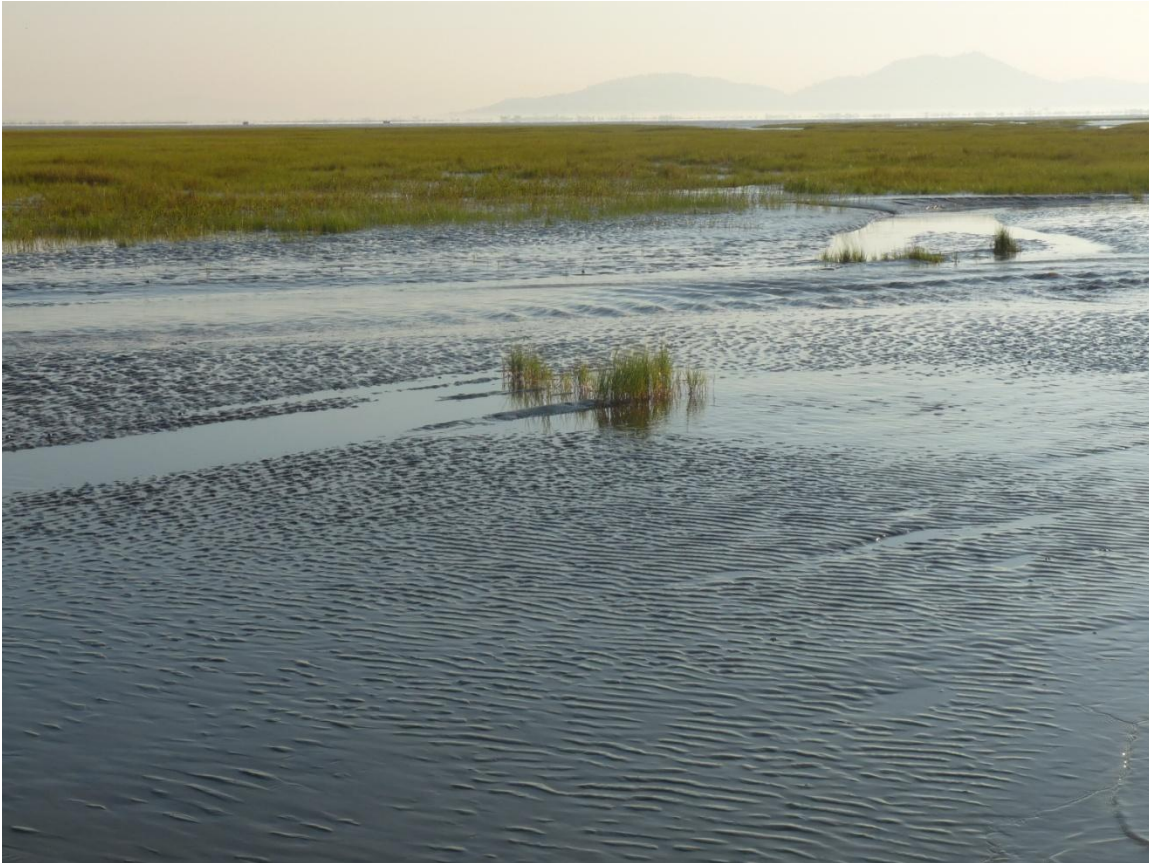
Figure 3 Spoon-billed Sandpiper feeding habitat in the Upper Estuary of the Bay of Martaban, Myanmar 31st January

The 2010 survey of the Bay of Martaban not only highlights the importance of this dynamic intertidal system for birds, fish and local people's livelihoods, but also in our view means that Myanmar hosts the majority of wintering birds of this critically endangered shorebird. The colour-marked birds indicate a link between South Chukotka and the Bay of Martaban, supported by a colour-marked bird observed in neighboring Thailand in November 2005. Light blue flags have only been observed at stop-over sites and in Nan Thar in 2008. Although it is a very small sample it suggests that birds from the Northern population might have different flyways, supported by the only ring observation in neighboring Bangladesh, which originated from North Chukotka. Segregation of wintering areas in relation to the breeding range has been observed